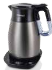
碳灰 Charcoal Grey KTV-215GY