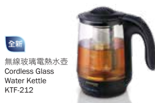
全新 無線玻璃電熱水壺 Cordless Glass Water Kettle KTF-212