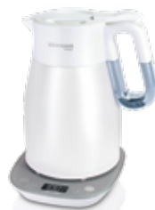
雪白 Snow White KTV-215WT