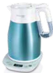
湖水藍 Lake Blue KTV-215BL