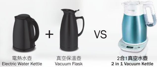
電熱水壺 Electric Water Kettle

Combining water kettles and insulating flasks into one, German Pool 2 in 1 Vacuum Water Kettle can swiftly boil water, as well as keeping it warm throughout 12 hours, equipped with 40°C-100°C precision controls, the user can flexibly control the water temperature to their own need, making it much more safe and eco-friendly.