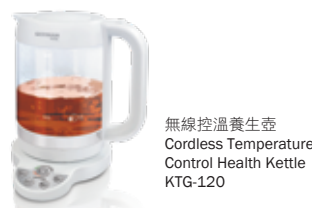
無線控溫養生壺 Cordless Temperature Control Health Kettle KTG-120

產品規格及設計如有變更，恕不另行通知。最新版本以www.germanpool.com網上版為準。 Specifications are subject to change without prior notice. Refer to www.germanpool.com for the most up-to-date version.