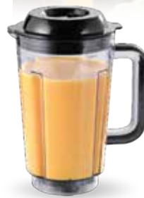
真空攪拌杯 Vacuum Blended

專業設計令攪拌效果更出色，1.5L大容量， 足夠全家分享。 Professionally designed to enhance overall design, 1.5L extra large capacity fit for the entire family.