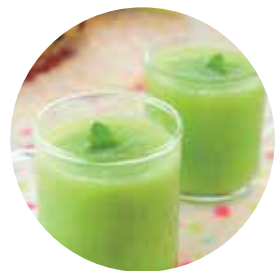
高纖果汁 High-Fiber Fruit Juices

抽出杯內空氣，用於真空儲存， 有效延緩氧化 Extract the air inside for vacuum storage, prolonging oxidation process