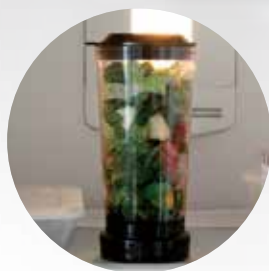
真空保鮮 Vacuum Preservation

抽真空和攪拌一鍵搞定，輕鬆 炮製真空果汁 Vacuum & blending with a touch of a button, easily create nutritious juices