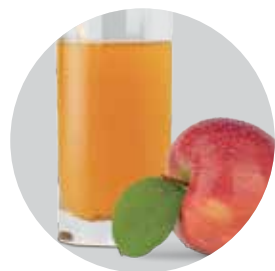
真空攪拌 Vacuum Blend

抽真空和攪拌一鍵搞定，輕鬆 炮製真空果汁 Vacuum & blending with a touch of a button, easily create nutritious juices