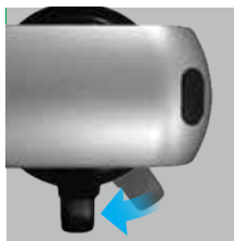
1. 微動安全鎖 Safety Lock Mechanism

放上攪拌杯，順時針轉動直至鎖緊，確保穩固不傾倒 Place the cup into the machine, twist clockwise to fasten into place ensuring stable placement.