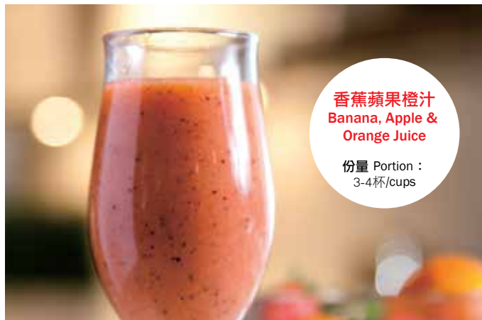
香蕉蘋果橙汁 Banana, Apple & Orange Juice