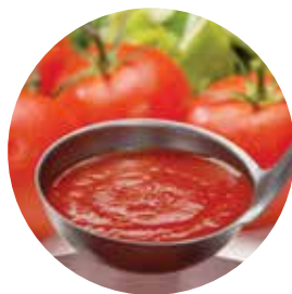
自製醬汁 Creamy Rich Soups

特設高速攪拌功能，炮製細膩 幼滑高纖果汁 High-speed function for creating smooth high-fiber juices