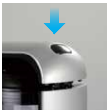
2. 翻蓋安全開關 Secure Lid Interlocking

放上攪拌杯，順時針轉動直至鎖緊，確保穩固不傾倒 Place the cup into the machine, twist clockwise to fasten into place ensuring stable placement.