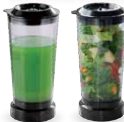
真空保鮮杯 Vacuum Preservation

無論是真空保存蔬果汁，還是裝沙律 都同樣出色，更便可攜出街。 Vacuum seal preserving food, great for juices or even salads. Bring it along anywhere.