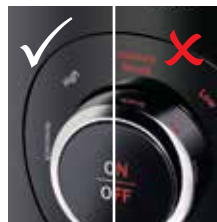
3. 安全啟動指示燈 Safety LED Operational Light

緊密扣合，確保真空不漏氣；一按解鎖，輕鬆排氣開蓋 Secure interlocking ensuring vacuum seal! One press to unlock and release.