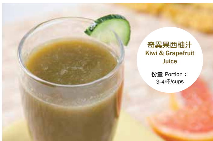
奇異果西柚汁 Kiwi & Grapefruit Juice

1. 將所有材料放入攪拌杯內。 2. 選擇「真空攪拌」功能，按「ON/OFF」鍵開始及停止攪打。 1. Put all ingredients into the blend jar. 2. Select Vacuum Blend mode. Press ON/OFF to start and stop.